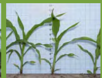
Genuity™ VT Triple PRO™ corn with Acceleron™ corn seed treatment products* *Includes fungicide and insecticide products