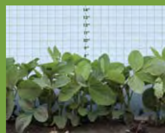
Untreated Roundup Ready® soybeans