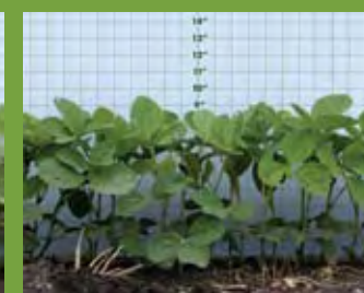
Roundup Ready® soybeans with commercial seed treatment† †Includes fungicide and insecticide products