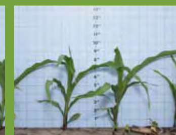
Corn with commercial seed treatment† †Includes fungicide and insecticide products