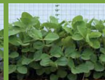
Genuity™ Roundup Ready 2 Yield® soybeans with Acceleron™ soybean seed treatment products* *Includes Plant Health, fungicide and insecticide products