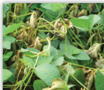
White Mold (Sclerotinia stem rot)

Sclerotinia stem rot, or white mold, is a disease that can impact high yield potential soybeans and thrives under moist conditions and below average temperatures. The occurrence of white mold